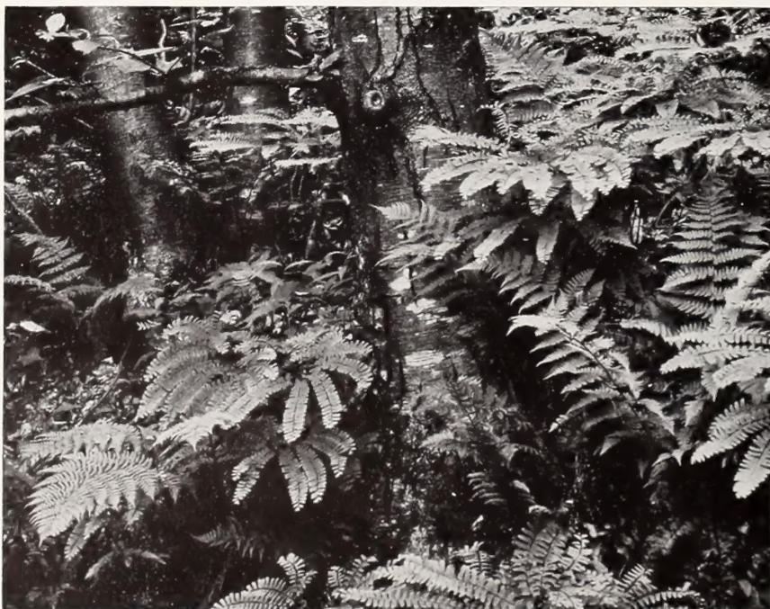
MAIDENHAIR AND EVERGREEN WOOD FERNS

Hardy Ferns except as noted. 40c each, 3 of one kind $1.00; 6 of one kind $1.50; 12 for $3.00; 100 for $20.00.